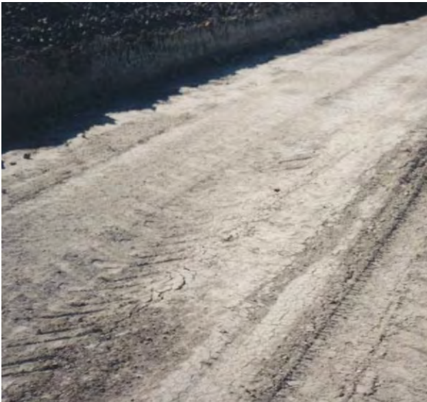
Figure 6: Lime Stabilized

Figure 6 shows the lime stabilized subgrade before final grading and compacting.