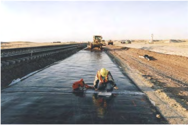
Figure 9: Inspection of Welds