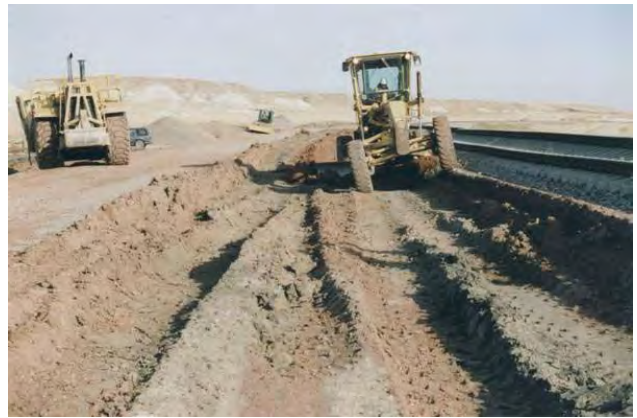
Figure 4: Base Preparation – Soft Area