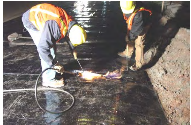
Figure 8: Welding the Membrane

As each roll is completed, the next roll is welded to the previous using a simple yet effective thermal welding process. The simplicity and effectiveness of the welding method for this type of geomembrane liner is a major benefit. The end of each roll of geomembrane is lifted slightly, and a propane gas torch is used to heat and liquefy the bitumen (Figure 8). The two layers of material are then brought together and then rolled with a light hand held roller to produce a continuous seam. The very edge is then heated and toweled over to remove any possibility of failure.