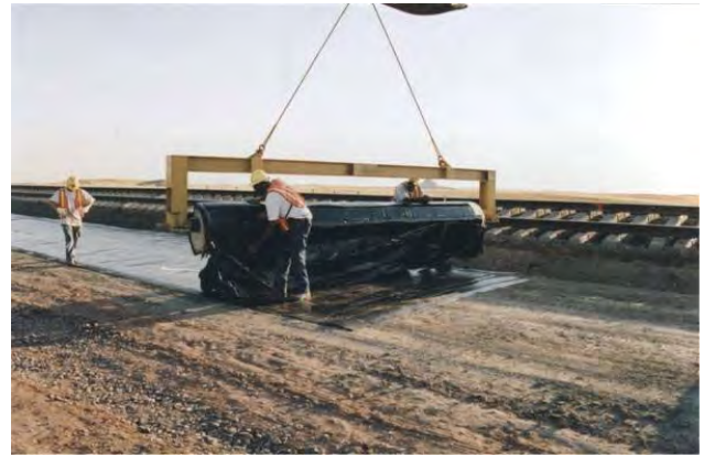
Figure 7: Placing the Membrane

Due to the durability of the geomembrane, it was possible to place the membrane without the use of a separate geotextile protection (Figure 7). This helped to improve the speed of installation, maximized the friction interface with the base, and reduced the overall cost.