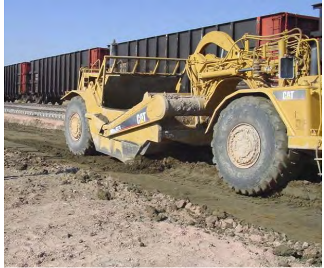
Figure 3: Base Preparation

Preparation of the base involved the removal of the existing ballast, subballast and the very soft clay surface (Figure 3). In areas where the clay was soft, as observed by rutting from the scrapers (Figure 4) the soft material was excavated and replaced with subballast.