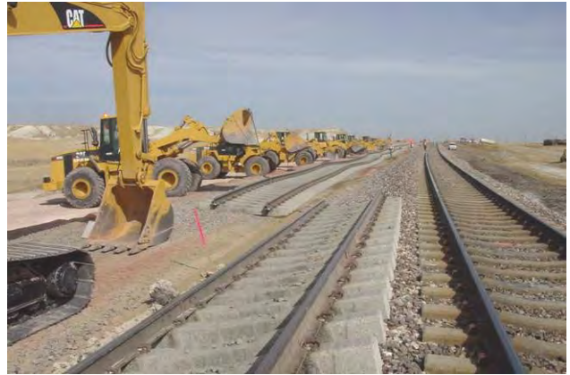
Figure 11: Replacement of Track