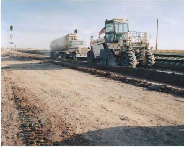
Figure 5: Lime Stabilization Equipment

Figure 6 shows the lime stabilized subgrade before final grading and compacting.