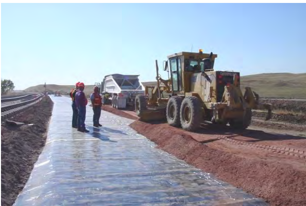
Figure 10: Sub-Ballast Placement

The bottom dump trucks first deposited subballast along the edge of the membrane. Then the blades plowed the subballast on top of the membrane to prevent vehicle traffic from causing wrinkles. Next a thin layer of ballast was placed followed by replacing the track panels (Figure 11). The remaining steps were to deposit the additional ballast, raise the track to grade, and tamp the ballast.