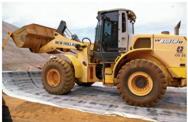
◀ Front loader driving on Coletanche

Due to its high puncture resistance, there was no need for Low Ground Pressure Equipment. The pressure applied by any tire of this 38,000lbs (17,000 kgs) front loader is 28 psi (193 kPa) as compared to the maximum of 8 psi (55 kPa) allowed on other flexible geomembranes protected by at least one foot (30 cm) of soil