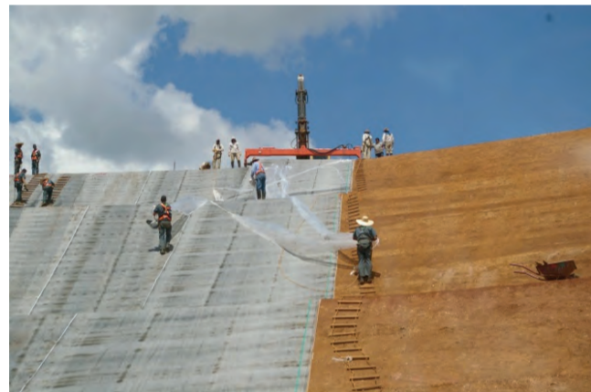
◀ Deployment of Coletanche on slope

COLETANCHE® (ES2 grade) was installed by a local general contractor in 115°F (45°C) temperature and high wind condition in November 2011.